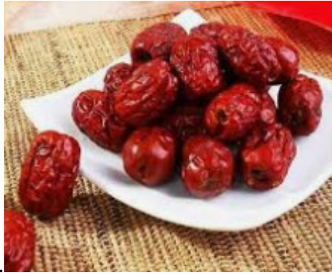
production of jujube in China.

Pear jujube is rich in vitamins, minerals, phenolic substances and essential amino acids. It is a traditional nourishing product and a combination of medicine and food. It has the functions of strengthening the spleen and nourishing the stomach, replenishing the vital energy, nourishing the lungs and strengthening the kidneys. Drug toxicity, anti-aging health care and other effects. In recent years, with the promotion and application of dwarf dense planting cultivation method in the Loess Plateau of northern Shaanxi, the mountain pear date has achieved good ecological and economic benefits.